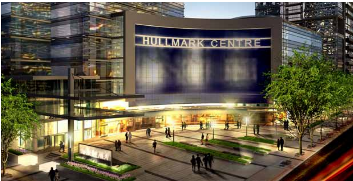
The Grand Plaza