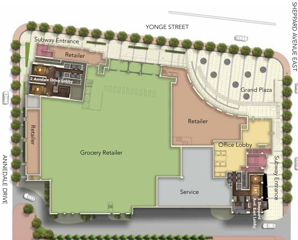
The Ground Floor Plan